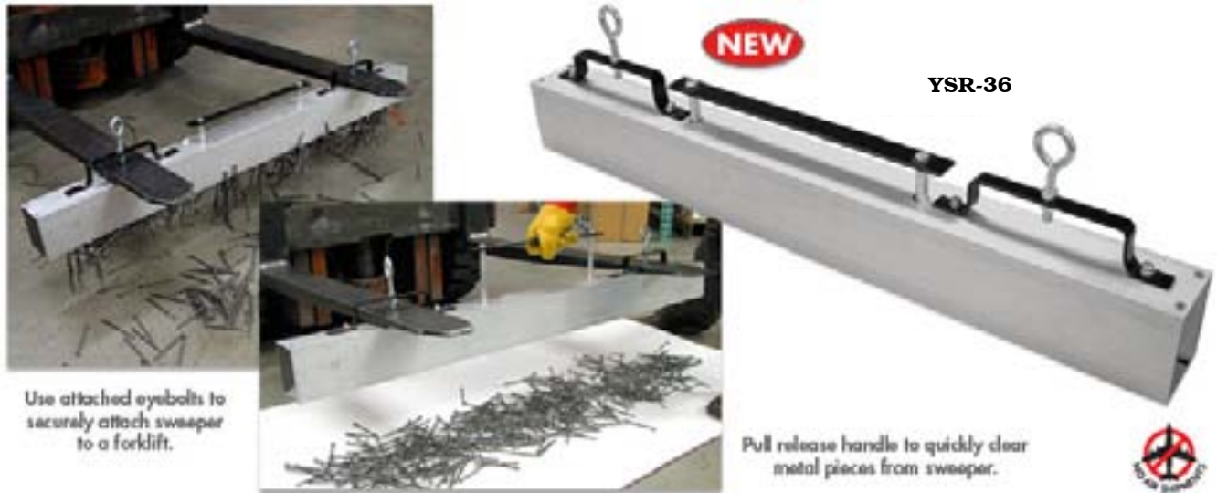
Use attached eyebolts to securely attach sweeper to a forklift.

Use these sweepers to clear factory and warehouse aisles and driveways. All models are 4" high by 3" deep - Eyebolts included. To unload, push the sweeper to the desired dumping area (i.e. a piece of cardboard) and pull the release handle. As the magnet rises, collected material is released from the collector plate.